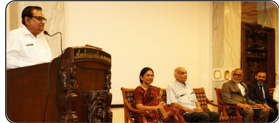
Higher Education Conclave on National Education Policy