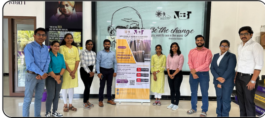
The Most Promising Manager Contest

Student life at NSBT is a vibrant mosaic of learning, growth, and community.